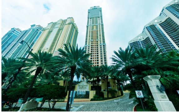
Mansions at Acqualina at 17749 Collins Avenue in Sunny Isles Beach